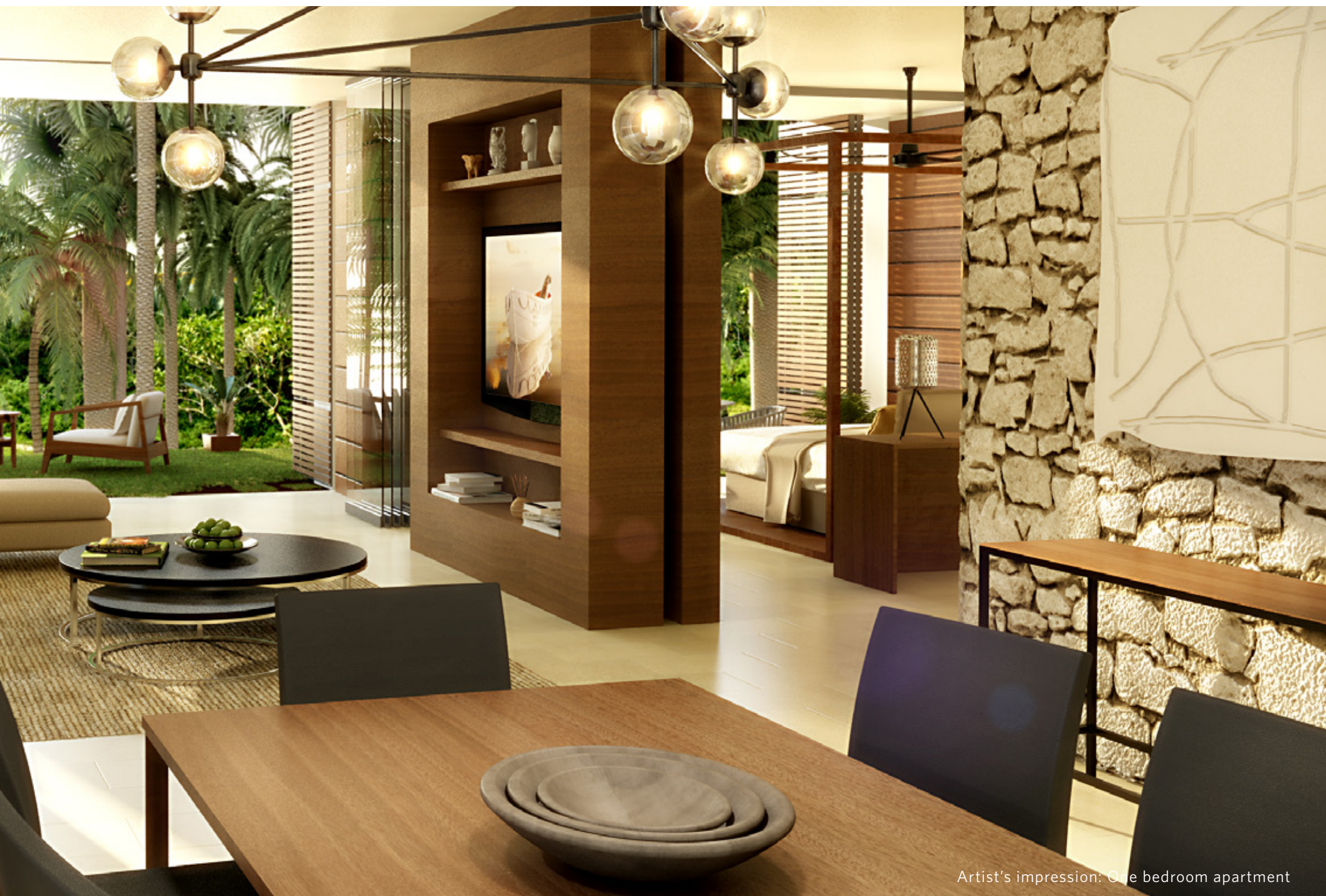
Artist's impression: One bedroom apartment