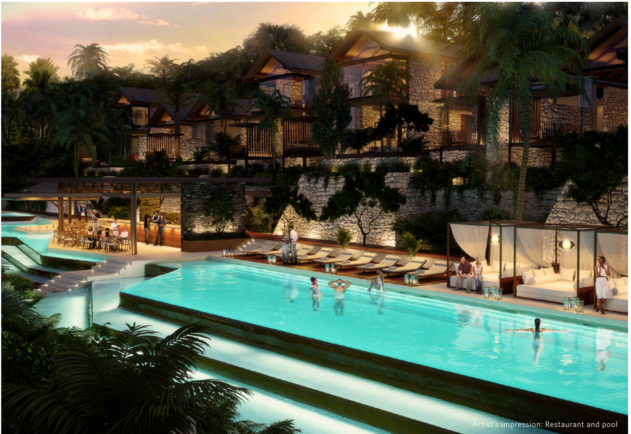
Artist's impression: Restaurant and pool